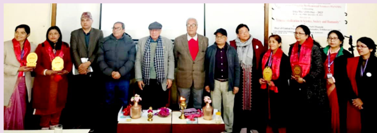
WoNiMS Members with Guest Professors at 10th Anniversary of WoNiMS-2080

“Commitment and Compassion for Professional Development”