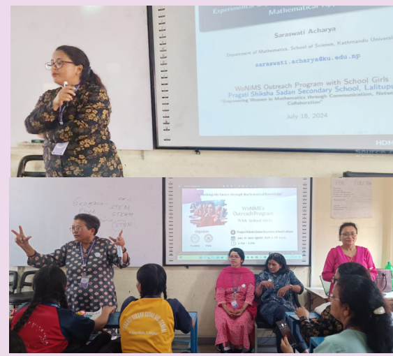
Outreach Programs at schools in Lalitpur